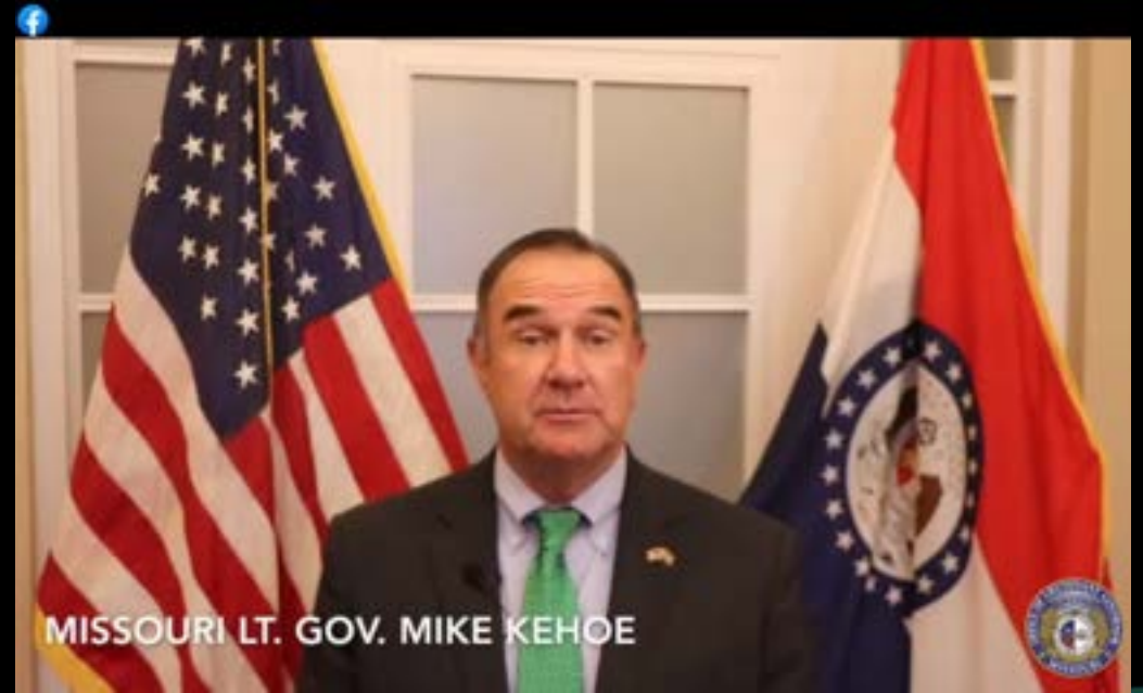
MISSOURI LT. GOV. MIKE KEHOE